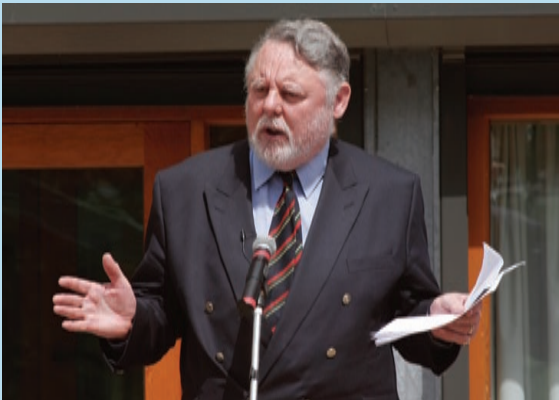
Terry Waite, appearing Thursday, November 15 at 7:15 p.m. Trinity United Methodist Church, Hackettstown

Join us for a remarkable evening featuring Terry Waite . Mr. Waite attracted worldwide attention in the early 1980s by successfully negotiating the release of several hostages from Iran. In 1983, he met with Libyan leader Moammar Gadhafi to bargain for the release of several British hostages. However, while negotiating for