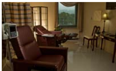
Newly Opened Infusion Therapy Room

If the presence of cancer is confirmed, the original or primary breast lesion can usually be treated conservatively, meaning with preservation of the breast. In many situations, limited surgery, lumpectomy and/or radiation therapy have demonstrated equivalent long term survival and cure rates opposed to radical mastectomy. Today, most women choose the limited surgery and radiation when offered the choice. The tumor is removed, or excised, along with clean, uninvolved margins of normal tissue. A surgical procedure, either lymph node dissection or sentinel lymph node sampling, is done to check for spread to lymph nodes in the armpit, or axilla.